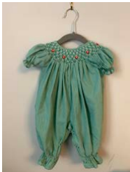
Nail on the Wall